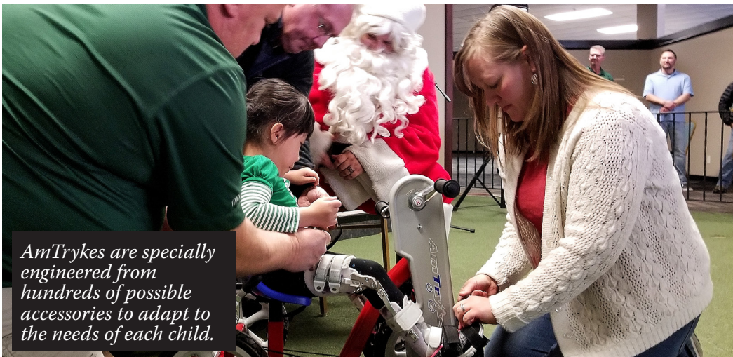
AmTrykes are specially engineered from hundreds of possible accessories to adapt to the needs of each child.